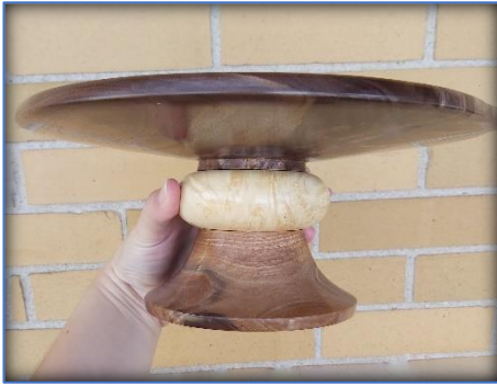
Top of Walnut cake platter by Kyle