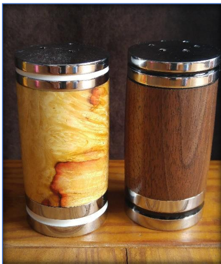
Salt & Pepper set by Kyle Desjardine

Wood burned engraving on the bottom of the pedestal to memorialize the occasion