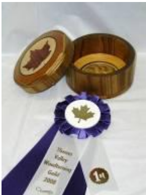
1 st Fred Simpson $75 award